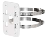
PFA152 Pole mount