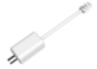
LR1002 ePoE Over Coax Converter