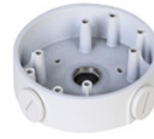
PFA139 Junction Box